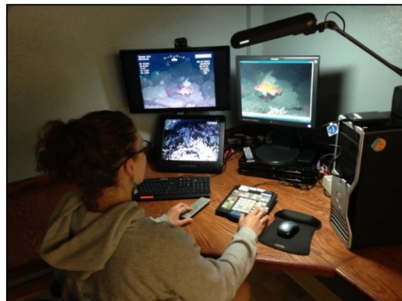
Figure 2. Typical video post-processing station.

After completion of video review for habitat and substrate, all video was processed to estimate finfish and macro-invertebrate distribution, relative abundance, and density. During three separate viewings of the video, finfish and macro-invertebrates were classified to the lowest taxonomic level possible. Observations that could not be classified to species level were identified into a species complex, grouped based on morphology, or recorded as unidentified. During video review, both the HD video and HD still imagery were used to aid in species identifications. Each fish or invertebrate observation was entered into a database along with UTC timecode, taxonomic name/grouping, sex/developmental stage (when applicable), and count. For fish only, size was estimated using the two sets of parallel lasers as a gauge. When applicable, estimates of total length were recorded with each fish observation. All clearly visible finfish were enumerated from the video record.